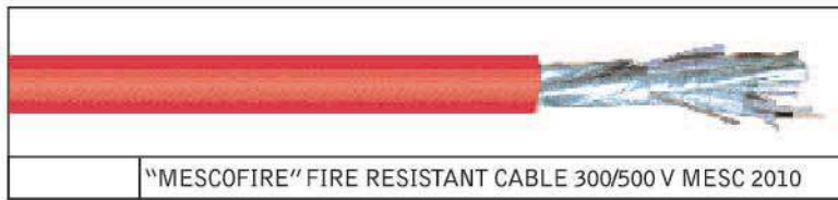
"MESCOFIRE" FIRE RESISTANT CABLE 300/500 V MESC 2010