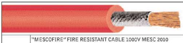
"MESCOFIRE" FIRE RESISTANT CABLE 1000V MESC 2010

SINGLE CORE CABLE FOR INSTALLATION IN BUILDINGS, POWER PLANTS & REFINERIES