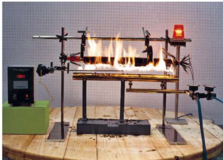
3 Hours fire survival test as per IEC-331

Specification Requirement : Minimum light transmittance - 60% min. As per IEC 61034 - 2 MESCOFIRE Typical light transmittance - 80 %