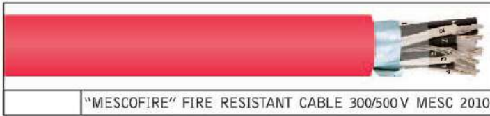
"MESCOFIRE" FIRE RESISTANT CABLE 300/500V MES C 2010